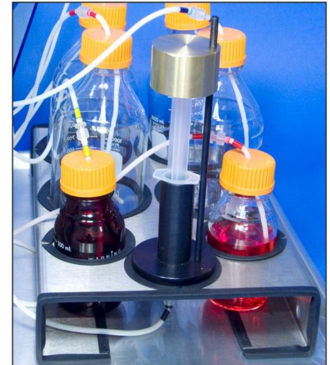
Figure 3: Syringe and holder ready for use.

This syringe Packaging its adapted To TEM stainer QG 3100 RMC